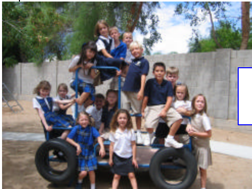
The Legacy 1st and 2nd Grade class of 2006/2007 on the playground.